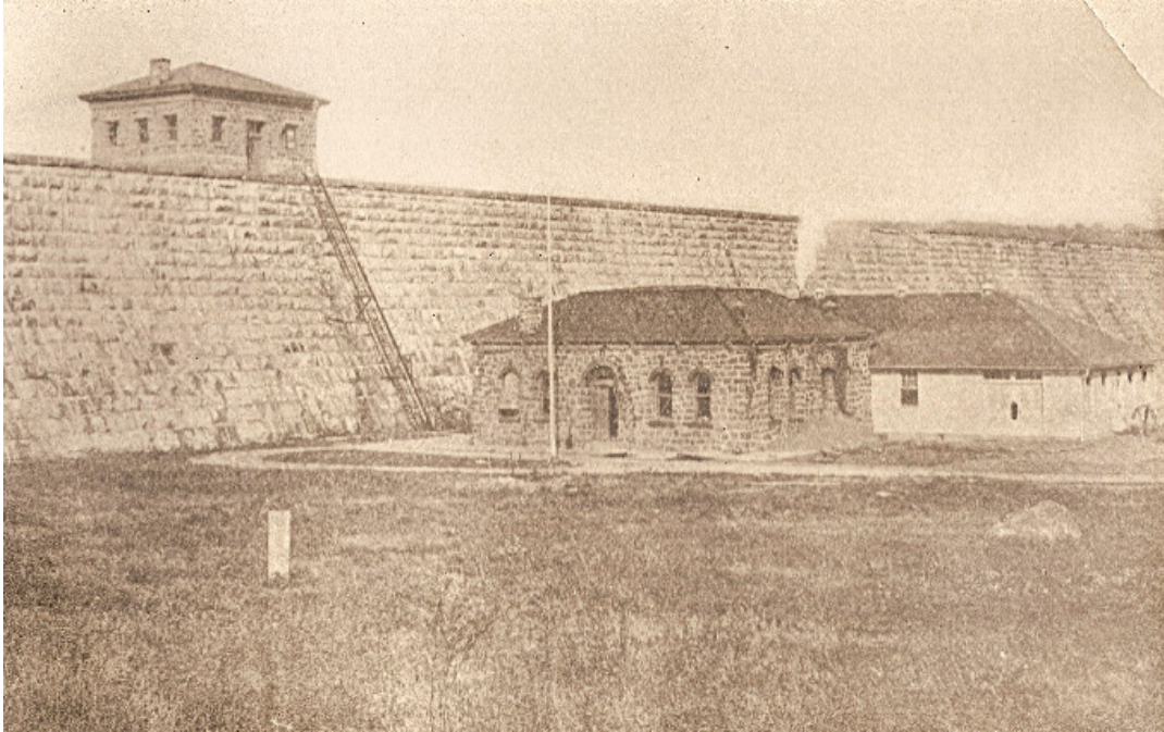
Gate Houses and Chlorination Plant at Boonton Reservoir circa 1908 (The chlorination plant is the building at the center.)

Unable to find the appropriate electrolytic equipment that would yield chlorine gas or liquid bleach, Leal decided to use powdered chloride of lime, the same disinfectant used by Johnson in Chicago. The necessary treatment apparatus was designed by Mr. George Warren Fuller of Hering & Fuller. Fuller created a system to add dissolved chloride of lime into the water supply as it left the Boonton Reservoir and flowed to the city. On September 26, 1908, the chlorination of Jersey City water began with George A. Johnson of Hering &