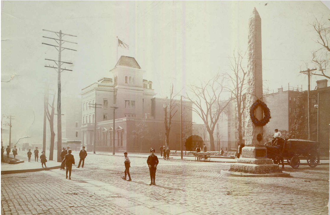
View of Jersey City, circa 1910

In 1908, Jersey City, located on the west bank of the Hudson River across from Lower Manhattan, was a busy industrial and railroad center and home to approximately 200,000 residents. For several years following the construction of a new water supply system in 1904, the city had been at odds with the local water company over the quality of the municipal drinking water. Jersey City had sued the Jersey City Water Supply Company for failing to meet a contract requirement, namely that “the water to be furnished must be pure and wholesome for drinking and domestic purposes....” 4